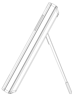
Shown with kickstand deployed