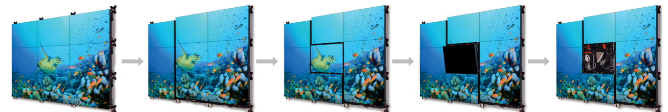
Servicing and replacing the middle panel has never been easier

Another revolutionary aspect of the UniSee Mount is that it facilitates servicing. Using a simple wrench to move the adjacent screens, all individual panels are easily accessible from the front - even the middle panels. Each panel can be taken out swiftly and securely, making maintenance easier. Moreover, cabling and electronics can also be pre-tested before screen installation.