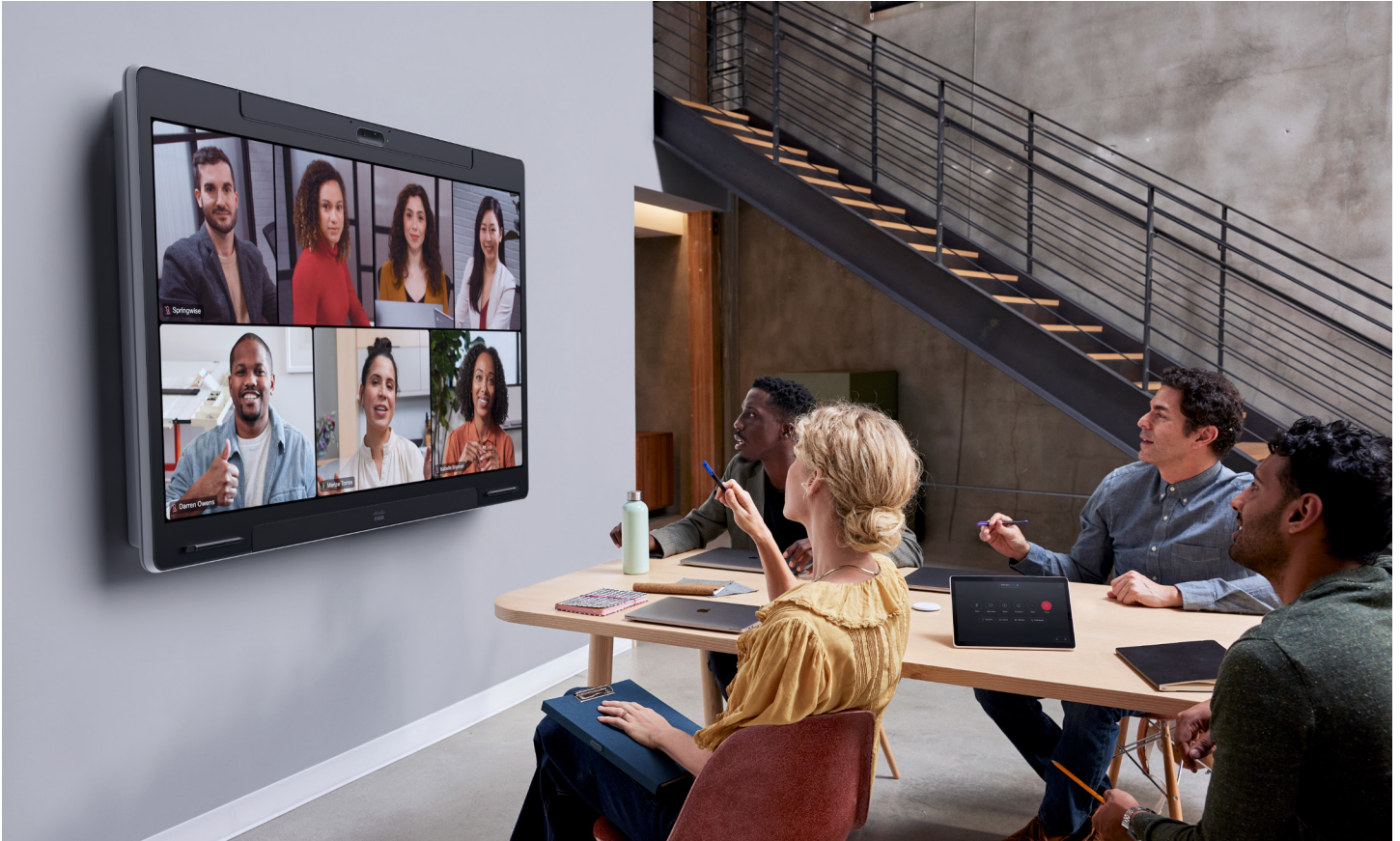
Figure 1. Video meeting with the wall-mount Board Pro 75 G2