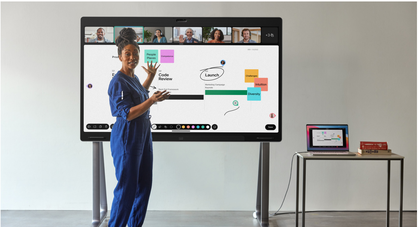
Figure 3. Cisco Board Pro 75 G2 on floor stand with wheel stand upgrade running the Webex Whiteboard experience