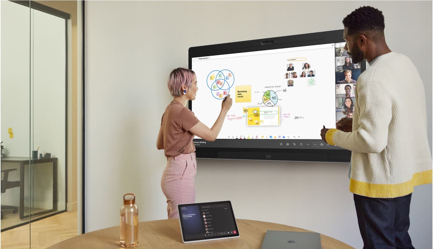
Figure 2. Digital whiteboarding in a Microsoft Teams meeting using the Board Pro 55 G2