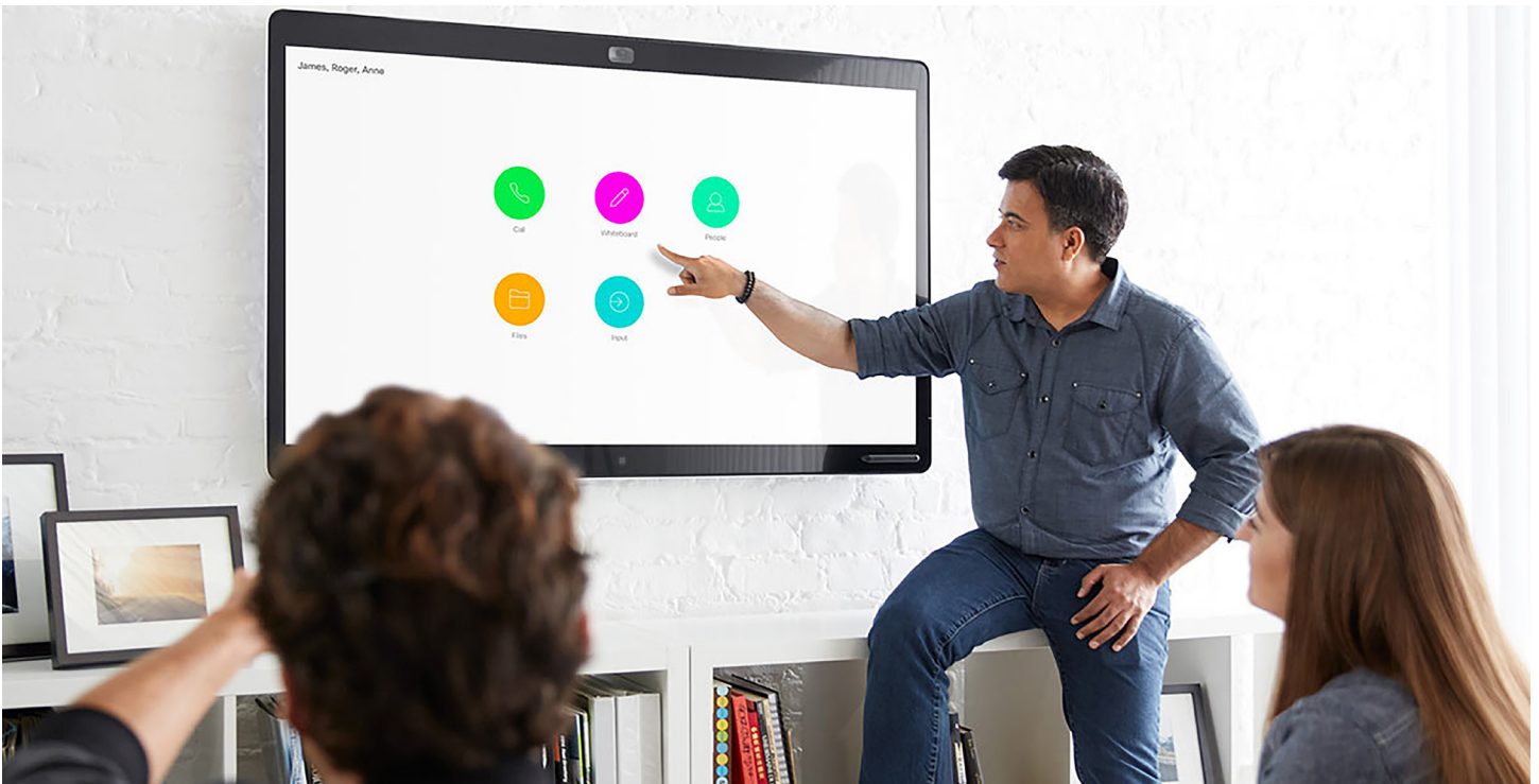
Figure 2. Meeting join on the Webex Board

The Webex Board 55S* is a fully self-contained system on a high-resolution 4K 55-inch LED screen. With an integrated 4K camera, embedded microphones, and a capacitive touch interface, the board brings intelligence, style, and usability to meeting rooms, from small to large. Designed with minimal wires for simplicity and elegance, Cisco's latest collaboration device allows