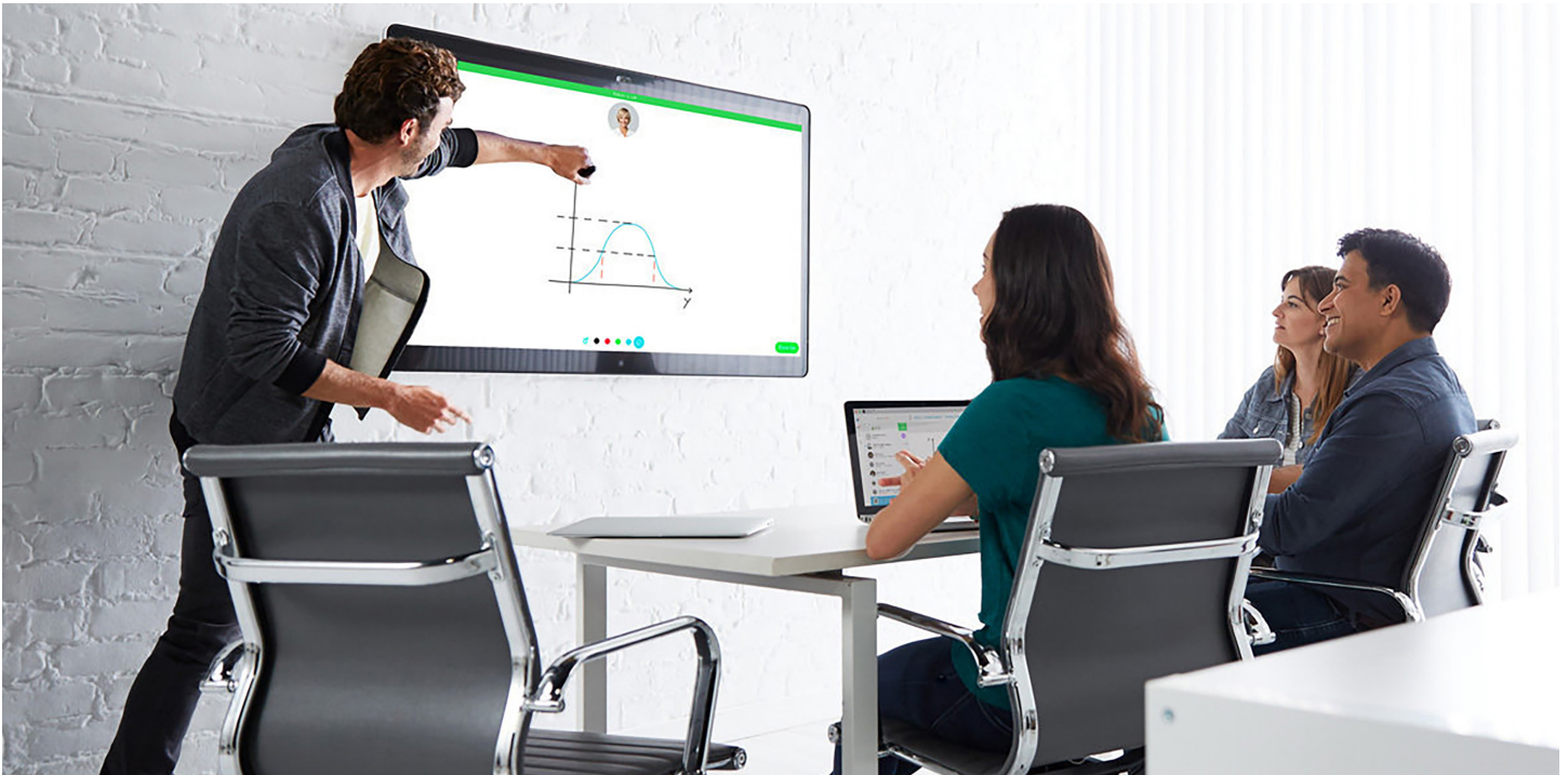
Figure 1. Whiteboarding capability on the Webex Board 55

The Webex® Board is an all-in-one device that provides everything you need to collaborate with your teams in physical meeting rooms. You can wirelessly present, white board, and have video and audio calls. And it securely connects to your virtual teams through the Webex service or via your Webex App-enabled devices, so you can take your meetings and content on the road. The Webex Board 55S* is designed for huddle and small spaces up to five people. The Webex Board is also available in 70- and 85-inch screen options.