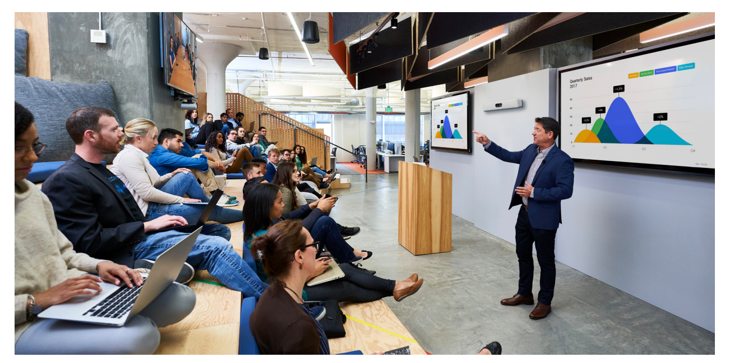
Figure 1. The Webex Room Kit Pro with dual screen setup deployed in auditorium

The Room Kit Pro delivers up to 2160p60 end-to-end UHD video. The codec's rich set of video and audio inputs, flexible media engine, and support for up to three screens enable a variety of use cases, adaptable to your specific needs. The Room Kit Pro can be registered on premises or to the Webex cloud service.