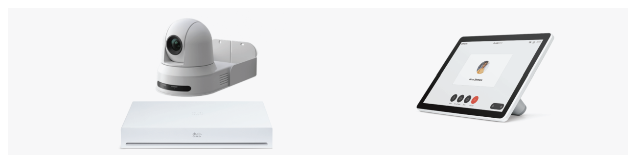
Figure 4. Webex Room Kit Pro PTZ 4K integrator package with Codec Pro, the Webex PTZ 4K Camera and Webex Room Navigator