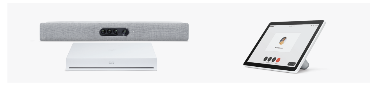
Figure 3. Webex Room Kit Pro integrator package with Codec Pro, Quad Camera and Webex Room Navigator