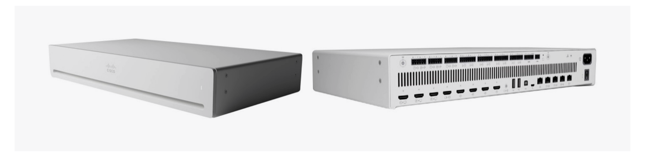
Figure 6. The Webex Codec Pro

The Codec Pro is also available separately as a standalone unit.