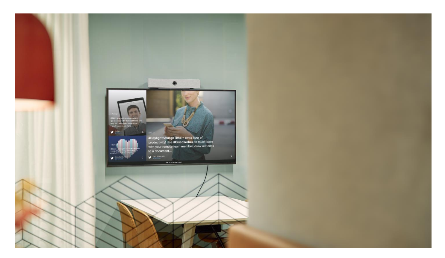
Figure 2. Digital signage on-screen with Cisco Webex Room USB