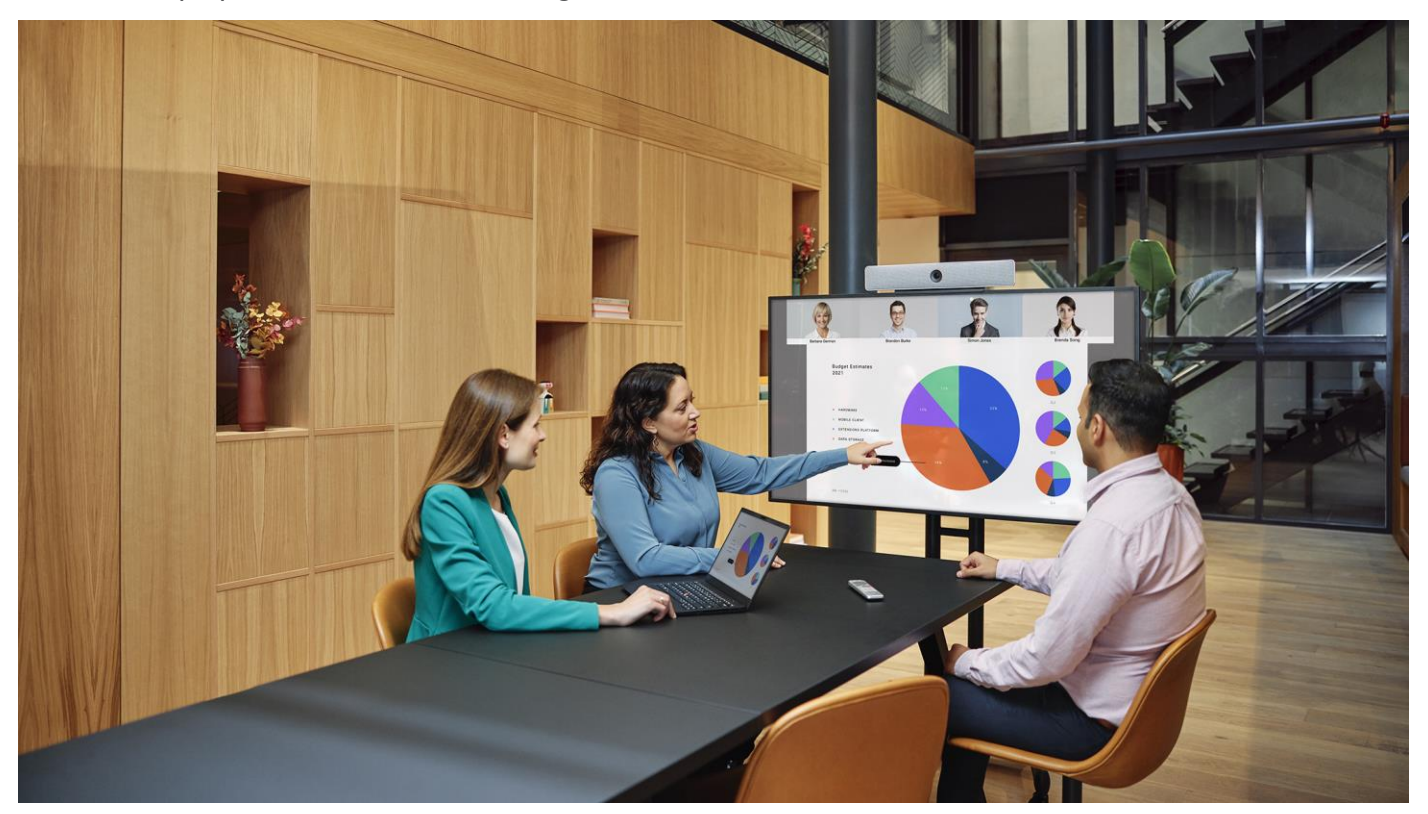
Figure 1. Cisco Webex Room USB in an open space

The Webex Room USB is ideal for huddle spaces with two to five people because of its wide 120-degree field of view, which allows everyone in a huddle space to be seen (see Figure 1). It offers the flexibility to connect to laptop-based video conferencing software via USB.