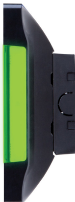
TSS-752-B-S - Side View with optional Multi-Surface Mounting Kit (sold separately)

Crestron Fusion Cloud supports the use of room occupancy sensors to detect when no one has shown up for a scheduled meeting. In such an event, the current reservation can be cancelled automatically to make the room available to others. Occupancy sensors do not connect directly to the TSS-752. They communicate with Crestron Fusion Cloud via a connection to a Crestron control system . Crestron GLS Series Occupancy Sensors [4] are available in a variety of types to support a connection to the control system using Cresnet®, infiNET EX®, or a Versiport I/O port.