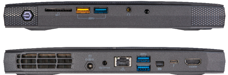
UC Engine – Front & Rear Panels

Ongoing XiO Cloud services facilitate daily management and monitoring of every device through a single dashboard with comprehensive reporting and logging, live status viewing and alerts, performance metrics and analytics, scheduled actions and updates, and more. As requirements grow and evolve, new features and functionality can be added easily to one or many devices at any time without ever going on site. XiO Cloud is a subscription-based service offering an adaptable SaaS (Software as a Service) solution with graduated levels of functionality and unlimited scalability. For more information about XiO Cloud, please visit https://www.crestron.com/xiocloud .