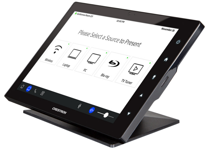
TSW-1060-B-S with TSW-1060-TTK-B-S Tabletop Kit

and other text content at a reduced brightness level