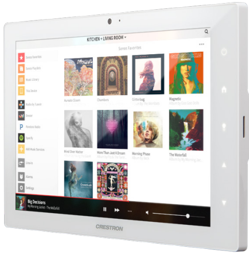
TSW-1060-W-S – Shown in White