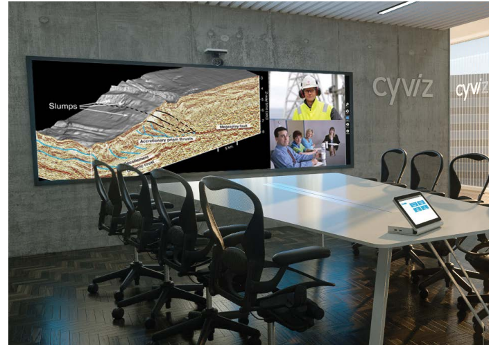
Cyviz screens and projection technology have been designed for professionals who require high levels of photorealism.