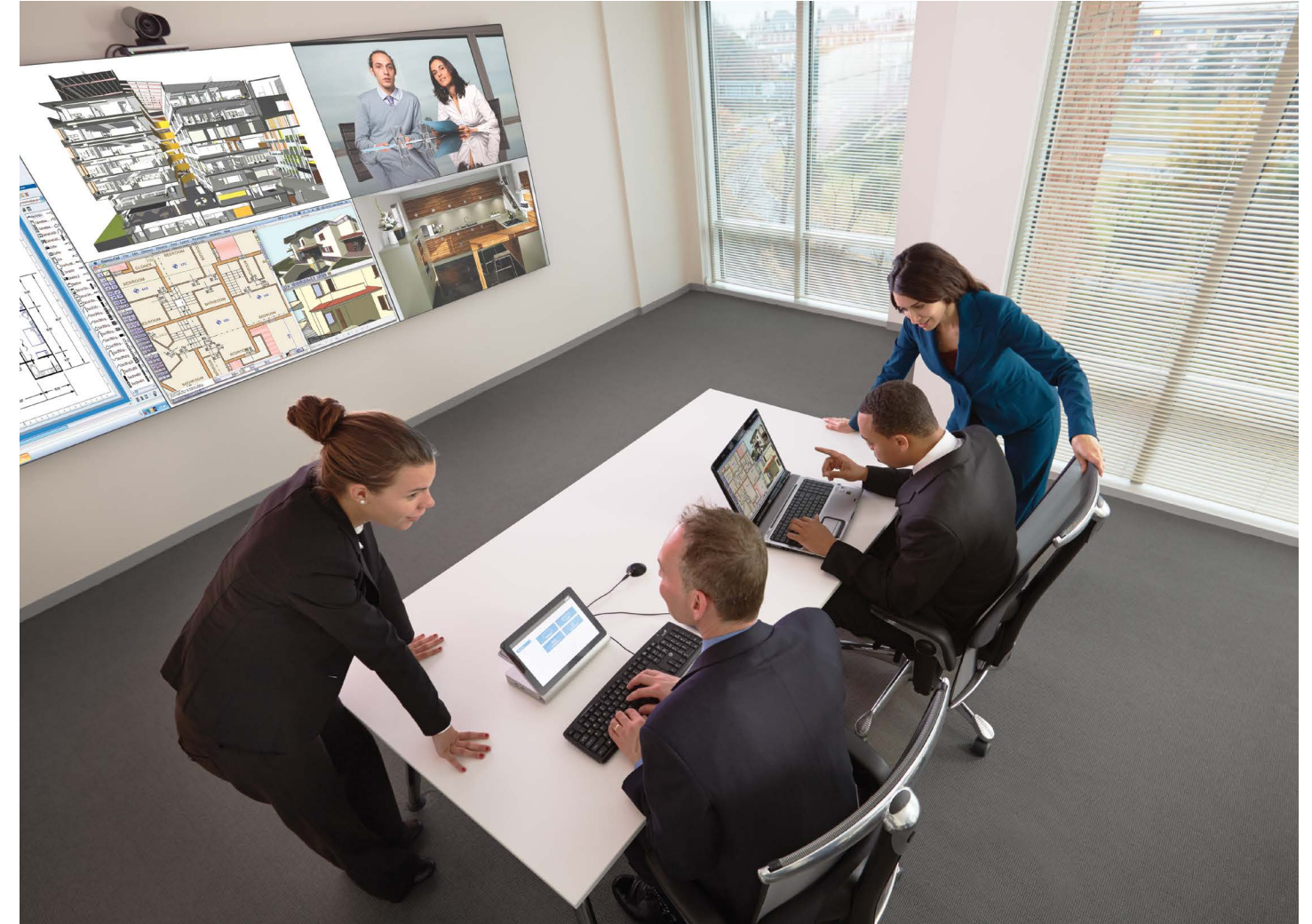
Multiple images, multiple sources—our systems boast unsurpassed flexibility.