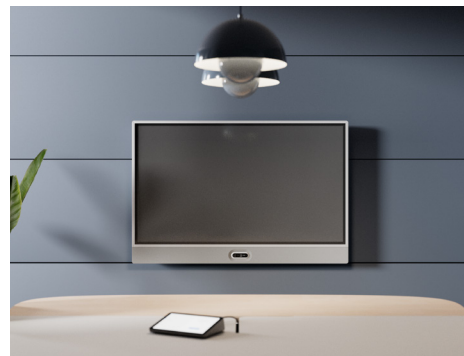
Wall mount with camera below

Designed for flexibility, Rally Board 65 is made for the way you meet. It works seamlessly with leading platforms like Microsoft Teams, Zoom, and Google Meet* in Android, PC, or BYOD mode, so you can easily adapt Rally Board 65 for current and future needs. Plus, it provides multiple mounting options**, so you can add it to any open space or meeting room. It's made to deploy with the camera above or below the screen to allow all participants to maintain natural eye contact in all spaces.