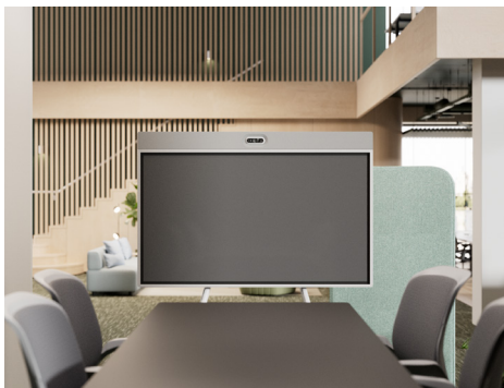
Cart with camera above