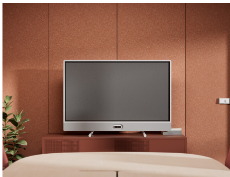
Table stand with camera below