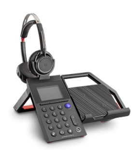
Elara 60 Series